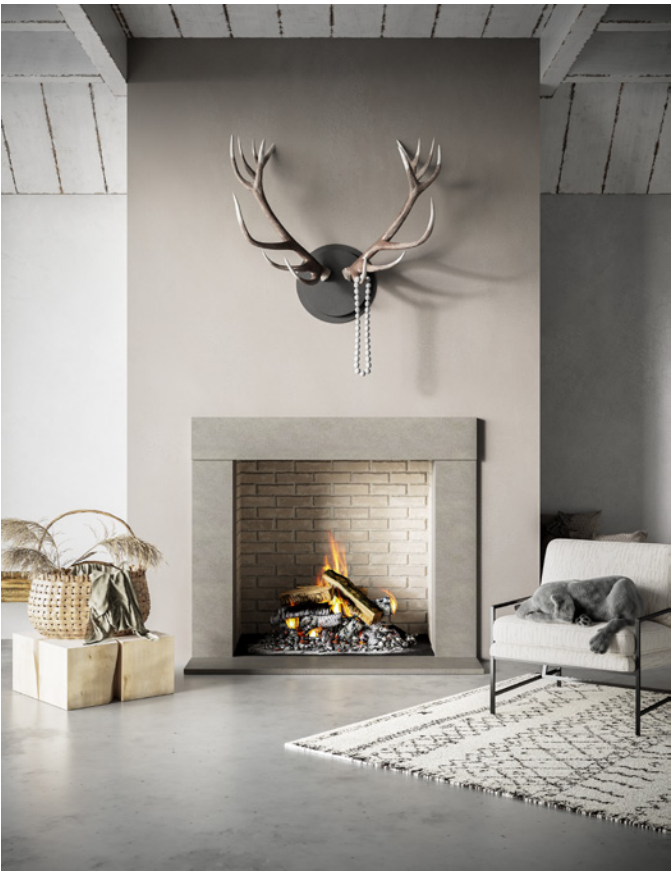
Shown in "Concrete" color. Hearth and trim kit sold separately.